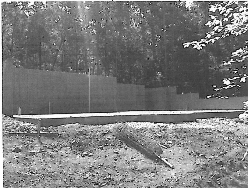
Rear View (Taken 07/09/2014)