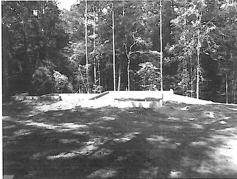
Front View (Taken 07/09/2014)

If using the Elevation Certificate to obtain NFIP flood insurance, affix at least 2 building photographs below according to the instructions for Item A6. Identify all photographs with date taken, "Front View" and "Rear View"; and, if required, "Right Side View" and "Left Side View." When applicable, photographs must show the foundation with representative examples of the flood openings or vents, as indicated in Section A8. If submitting more photographs than will fit on this page, use the Continuation Page.