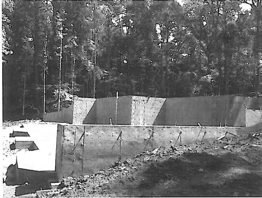
Left Side View (Taken 07/09/2014)

If submitting more photographs than will fit on the preceding page, affix the additional photographs below. Identify all photographs with: date taken; "Front View" and "Rear View"; and, if required, "Right Side View" and "Left Side View." When applicable, photographs must show the foundation with representative examples of the flood openings or vents, as indicated in Section A8.