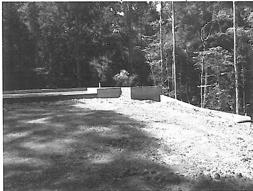
Right Side View (Taken 07/09/2014)